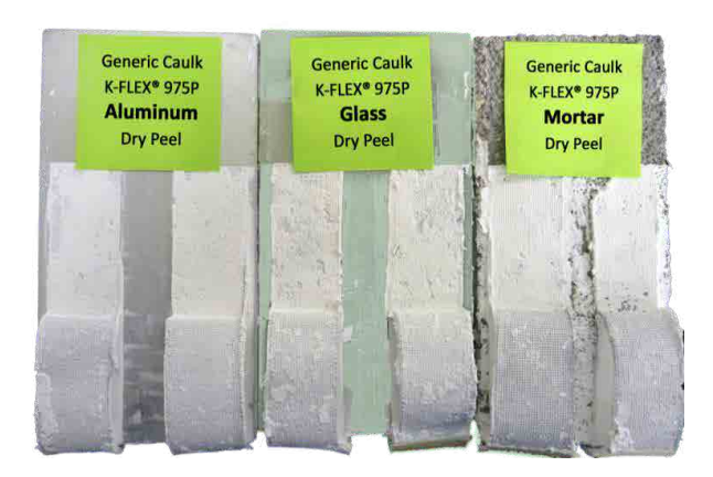
K-FLEX® 975P provided excellent adhesion-in-peel when tested in an ASTM C920 latex caulk over aluminum, glass, and mortar substrates.