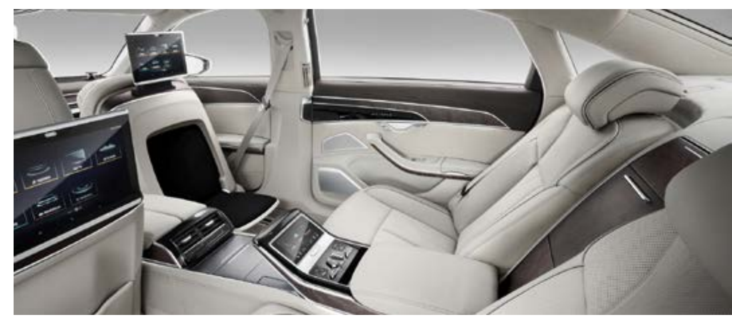
High-performance polymers and battery chemicals from LANXESS promote the global transformation to climate-friendly mobility.

In general, potential changes to any of the principles governing this Framework will either keep or improve the current level of disclosure.