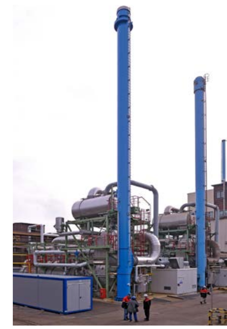
With its second nitrous oxide reduction plant at the Krefeld-Uerdingen site, LANXESS is the only manufacturer of adipic acid that can almost completely neutralize the climate gas emitted during production.

3 Emissions from operations that are classified as "discontinued operations" in Annual Reports are not in Scope