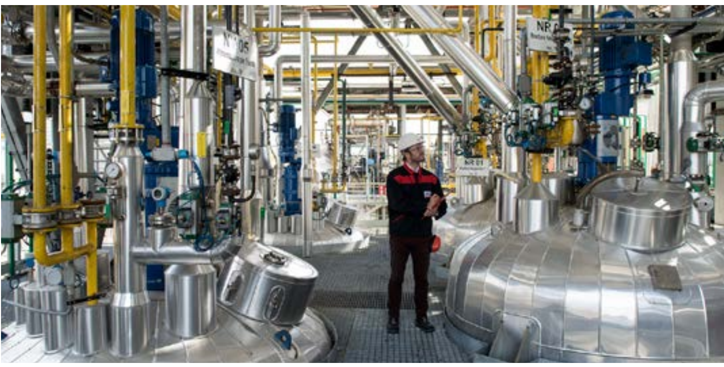
At its Latina site in Italy LANXESS produces, among others, the lubricant additive Naugalube.

The KPIs and SPTs set out in this framework will remain applicable throughout the tenor of any Sustainability-Linked Financing Instruments issued under the Framework, regardless of any changes to LANXESS' sustainability strategy or changes and future updates of the Framework.