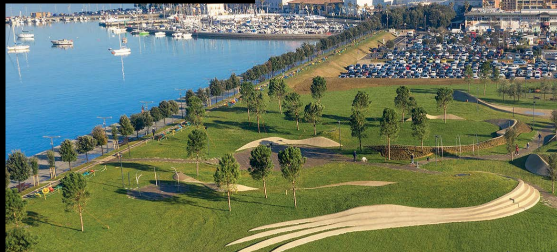
View of Koper's Central Park with adjoining car park and the old town and Koper's port

Koper's new city park is a prototype for future developments of the Slovenian Riviera, which has fallen into disrepair at times, particularly between Koper and Izola.