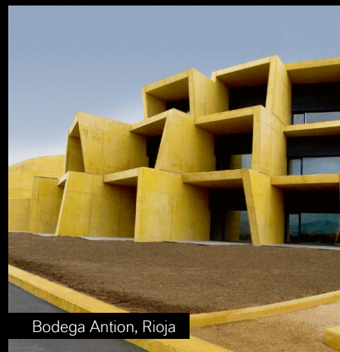
Bodega Antion, Rioja