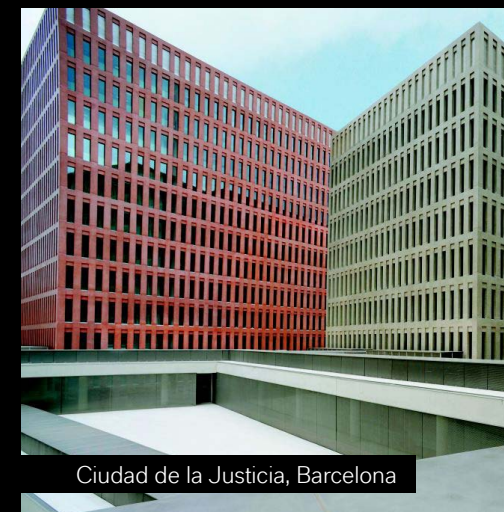
Ciudad de la Justicia, Barcelona